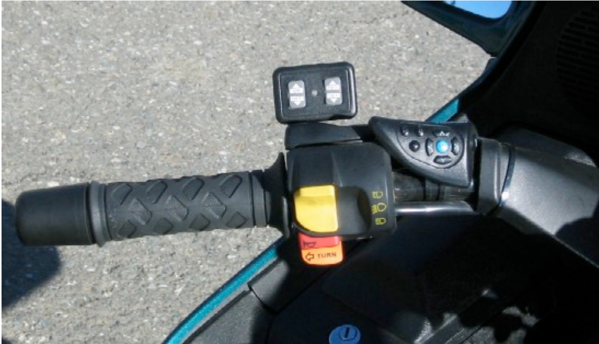
Here is the cruise control panel mounted on my K1100LT